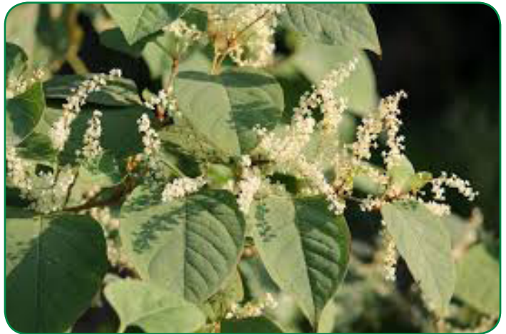
Japanese Knotweed spreads quickly and forms dense thickets that exclude native vegetation, thereby altering native ecosystems.