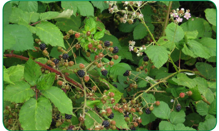
As delicious as these blackberries taste when they show up during the summer, they are considered a noxious weed, because of their ability to grow into thick, thorny, stubborn stands.

If you find any of these noxious weeds on your property, please remove them so they will not be able to spread to more areas in the neighborhood. Thanks for your help.