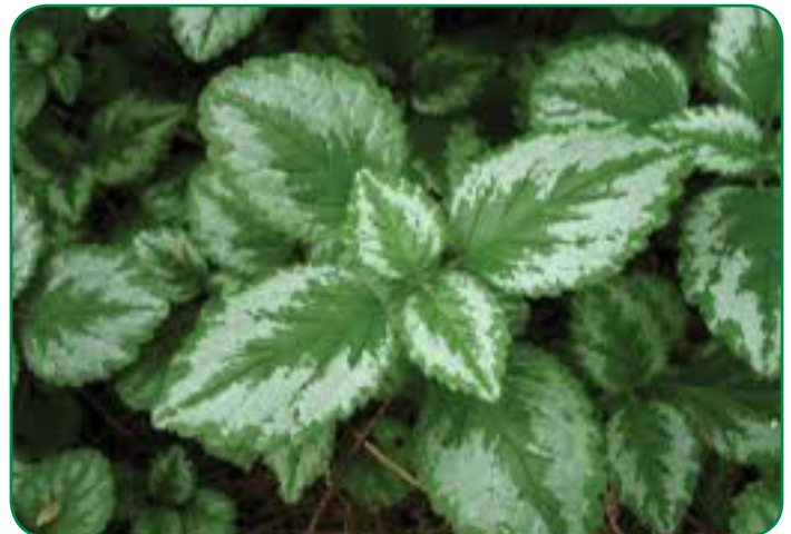
Although it is quite appealing to look at, Yellow Archangel escapes from residential plantings, to become very invasive. It forms dense mats of ground cover vegetation.